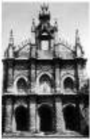
Plate 10 The Christian community in Thumba very graciously gave up this beautiful Church to house the first unit of the Space Research Centre.