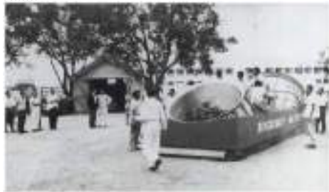
Plate 9 The twin-engine indigenous hovercraft prototype Nandi developed at ADE, Bangalore. As inventor and pilot, I took my rightful place at the controls.

In order to accelerate the pace of R&D activities at DRDL, it was imperative that decisions on vital scientific, technical and technological problems be taken quickly. Throughout my career I had zealously pursued openness in scientific matters. I had seen from very close quarters the decay and disintegration that go with management through closed-door consultations and secret manipulations. I always despised and resisted such efforts. So the first major decision which we took was to create a forum of senior scientists where important matters could be discussed