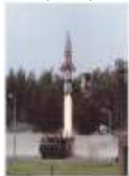
Plate 18 Successful launch of Prithvi, the surface-to-surface weapons system.