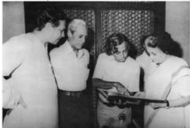
Plate 15 Prof Satish Dhawan and I explaining SLV-3 results to Prime Minister Indira Gandhi.

final phase of integration. He helped me deal with subsequent frustrations in its launching and consoled me when I was at my lowest ebb.