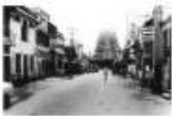
Plate 2 The locality in which I grew up: (a) My house on Mosque Street. (b) Thousands of pilgrims from great distances descend on the ancient temple of Lord Shiva. I often assisted my brother Kasim Mohamed in his shop selling artifacts on this street.