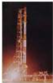
Plate 16 SLV-3 on the launch pad. This gave us many anxious moments!