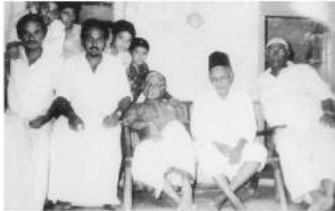
Plate 6 A family get-together.