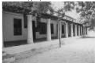
Plate 7 The simple surroundings of Schwartz High School, Ramanathapuram. The words on the plaque read "Let not thy winged days be spent in vain. When once gone no gold can buy them back again."