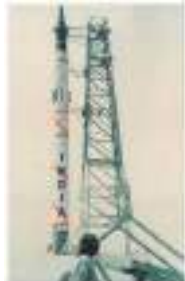
Plate 19 Agni on the launch pad, my long-cherished dream.