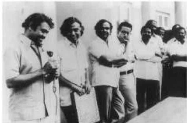
Plate 13 A presentation by a member of my SLV-3 team. In an unusual move, I made each of them present their portion of the work—my idea of project management.