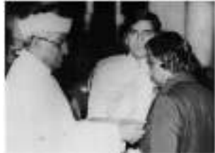
Plate 17 Receiving the Padma Bushan from Dr Neelam Sanjeeva Reddy, then President of India.