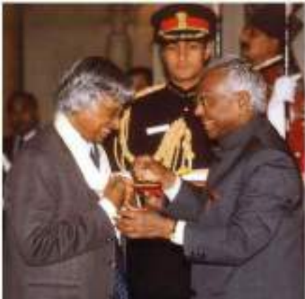
Plate 23 Receiving the Bharat Ratna from President KR Narayanan.