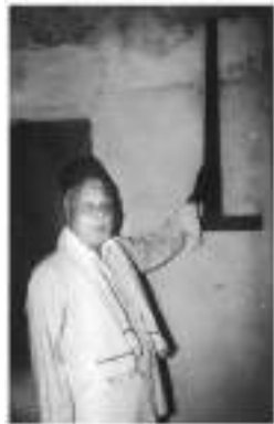
Plate 4 My brother pointing at the T-square I used while studying engineering.