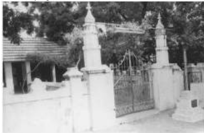
Plate 3 The old mosque in our locality where my father would take me and my brothers every evening to offer prayers.