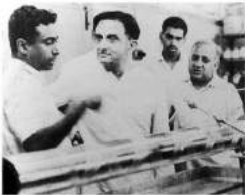
Plate 11 With Prof Vikram Sarabhai, a great visionary and the master planner behind India's Missile Development programme, at Thumba