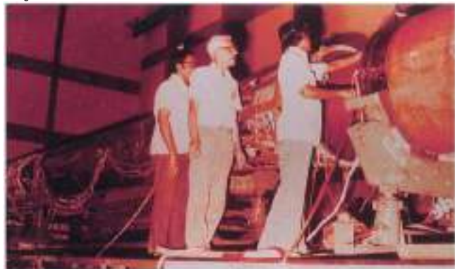
Plate 14 Dr Brahm Prakash inspecting SLV-3 in its